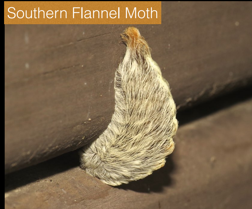
Southern Flannel Moth