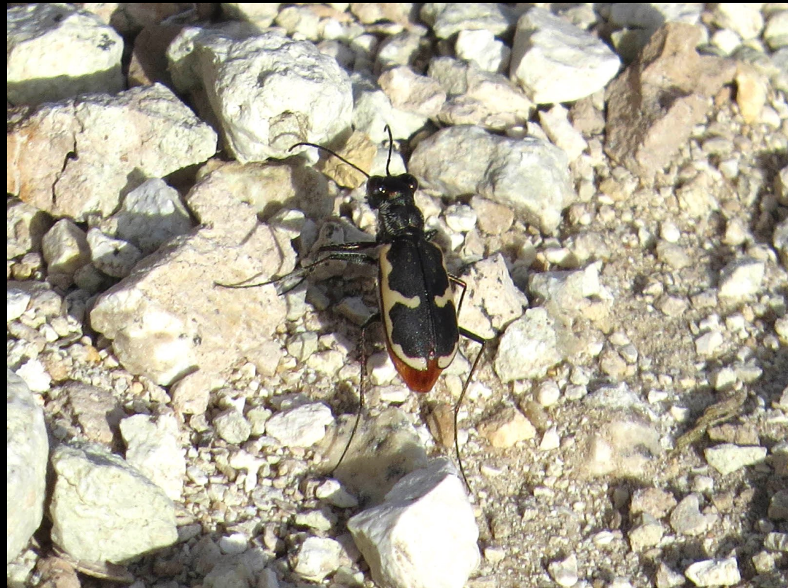
Schaupp's Tiger Beetle