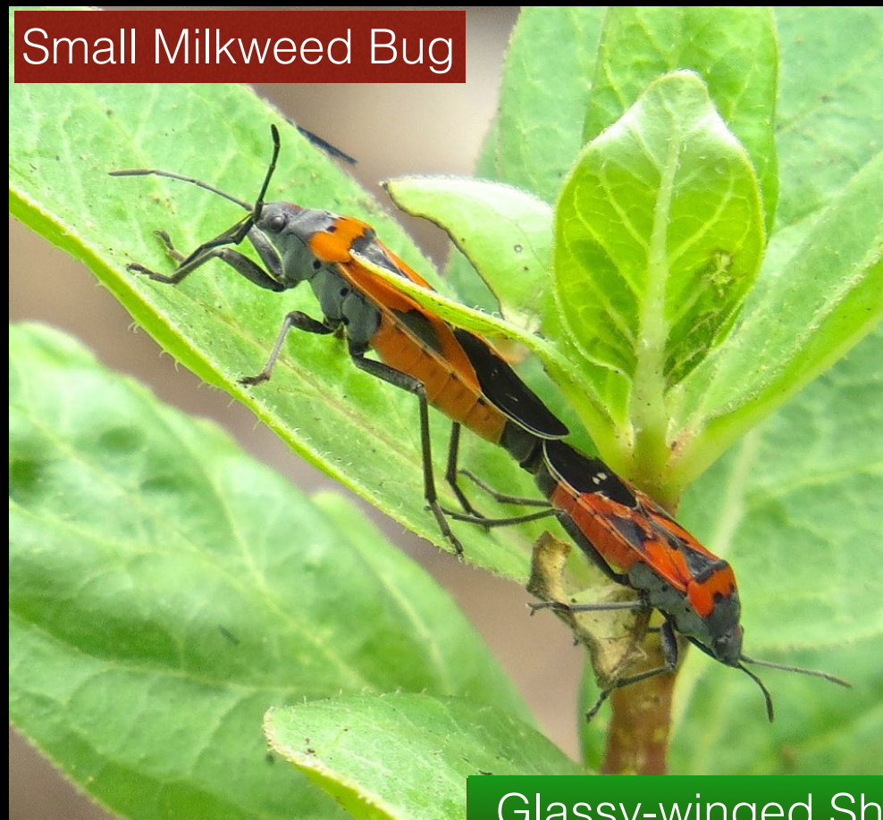
Small Milkweed Bug