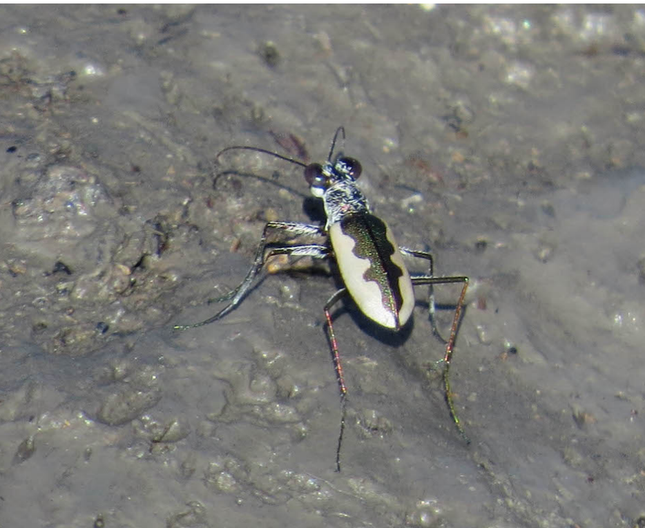
White-cloaked Tiger Beetle