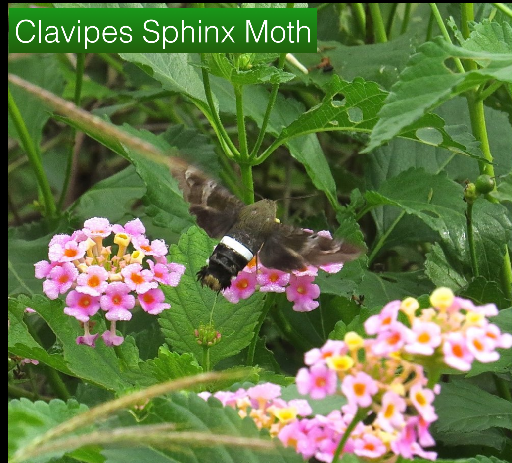
Clavipes Sphinx Moth