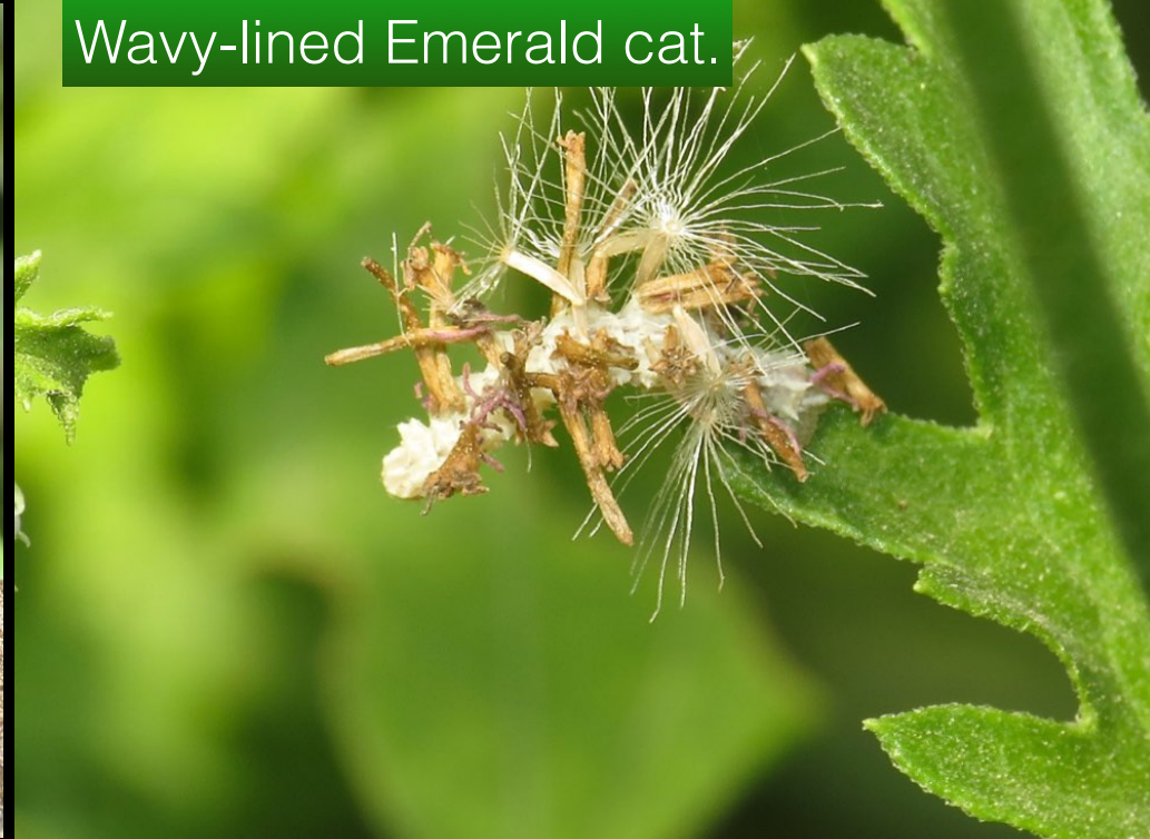
Wavy-lined Emerald cat.