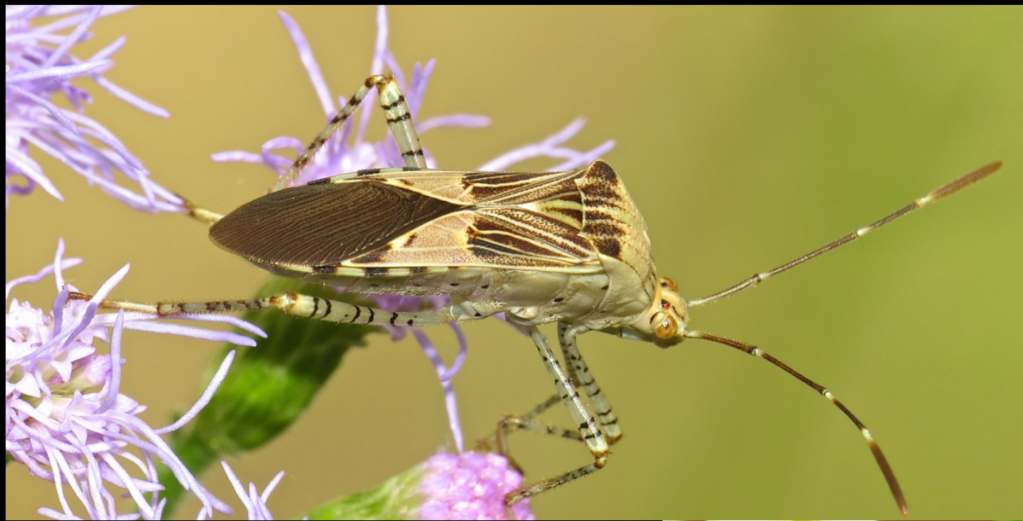
assassin bug ( Hypselonotus punctiventris )