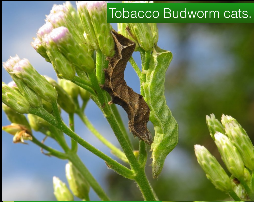
Tobacco Budworm cats.