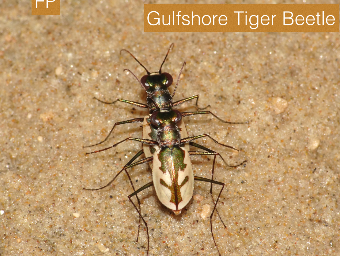
Gulfshore Tiger Beetle