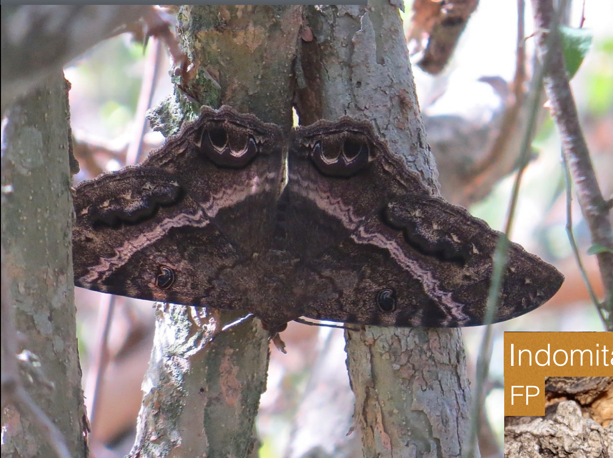
Indomitable Melipotis FP