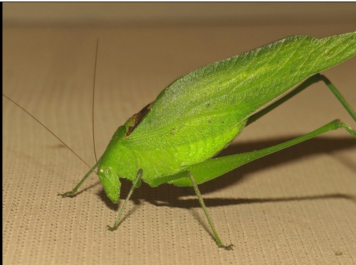
bush katydid ( Scudderia sp.)

Feeding on a Queen caught in a spider web