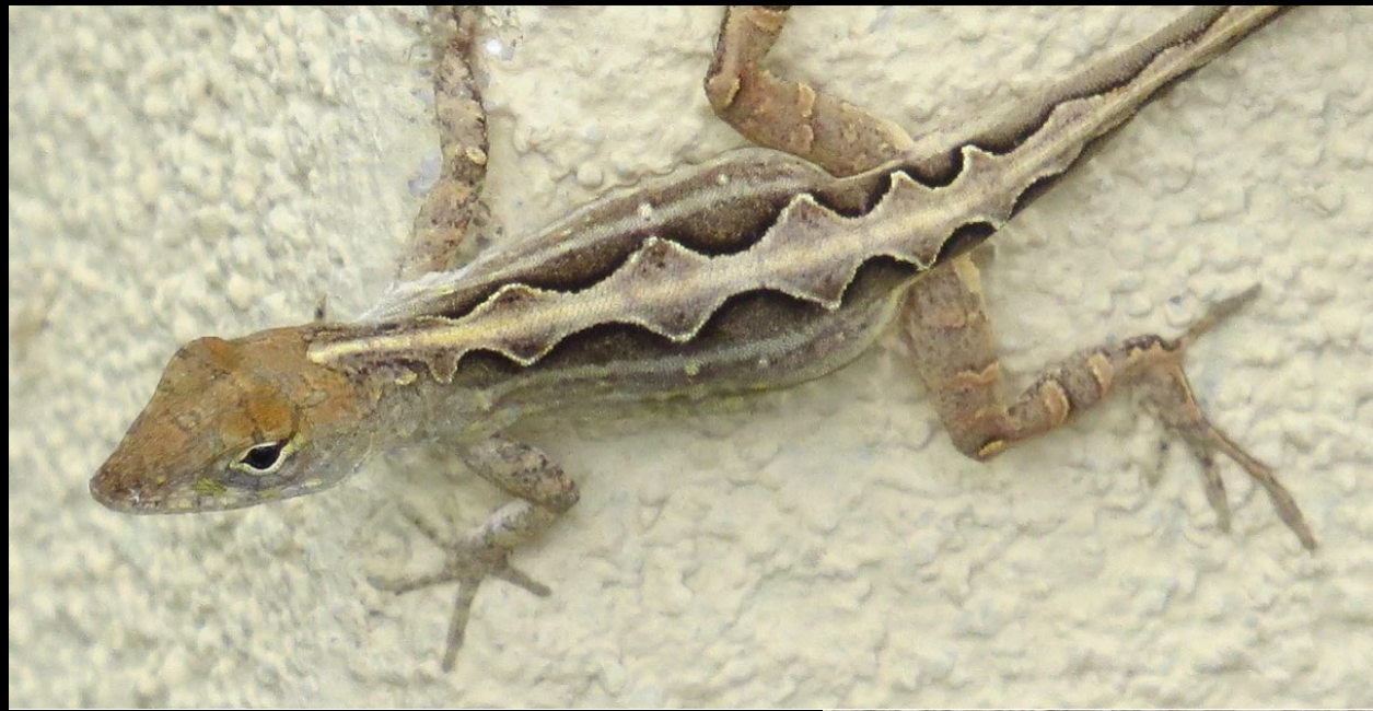
Diamond Back Anole