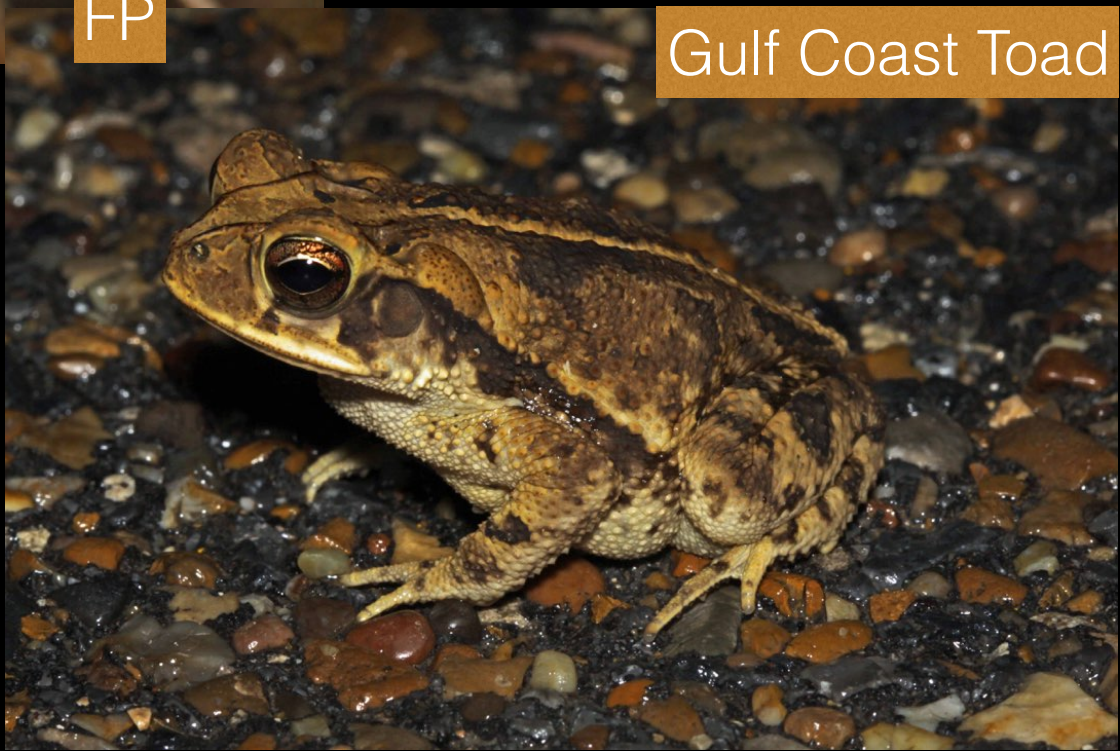
Gulf Coast Toad