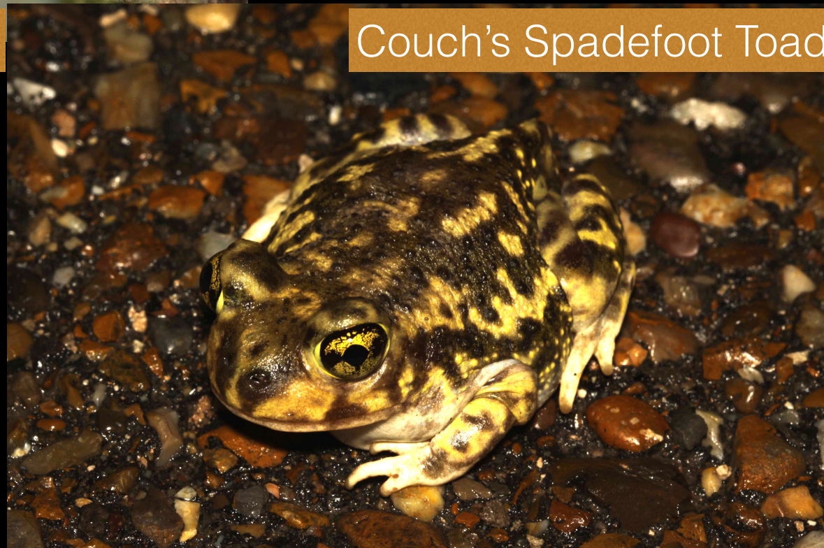
Couch's Spadefoot Toad